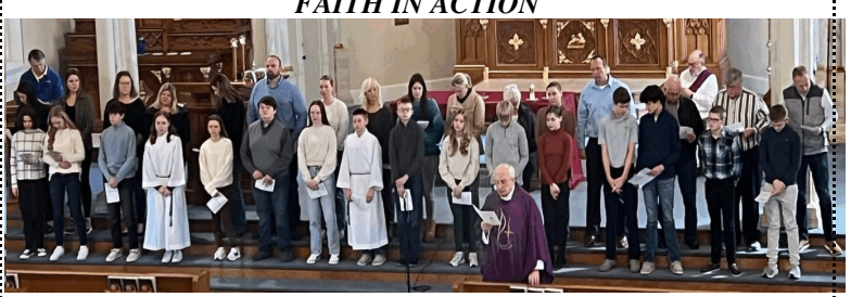
Rite of Election

Your General Fund contribution enables FAITH IN ACTION